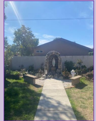
Garden at Convent