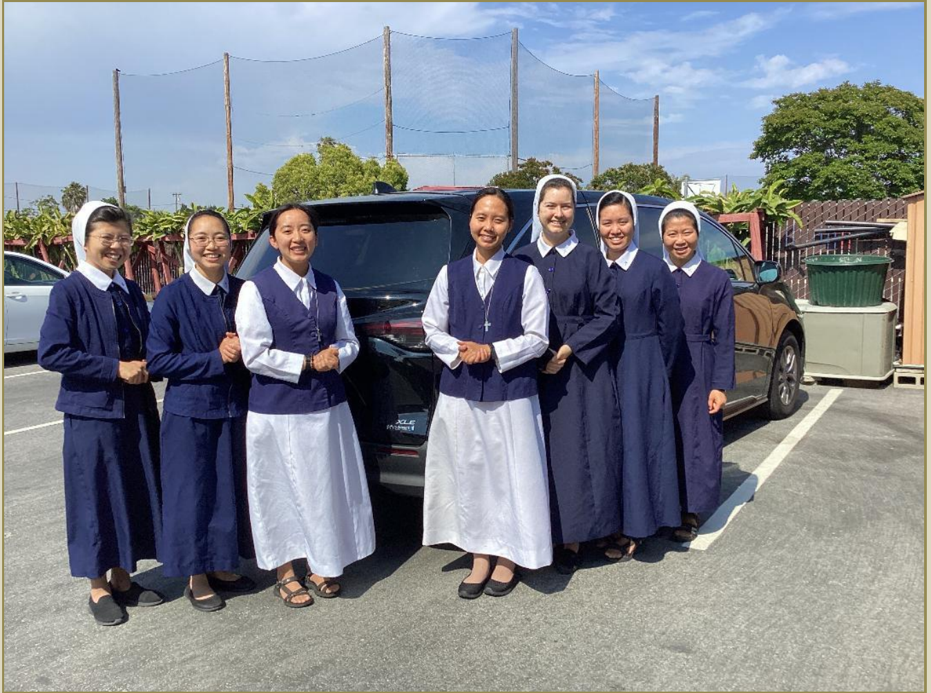
LOVERS OF THE HOLY CROSS NOVICES WITH THEIR NEW VAN