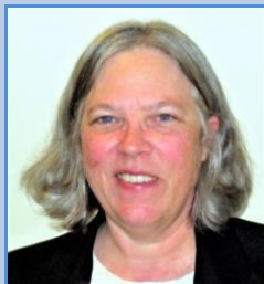
A Priest's Priest

Our meeting on August 4 this month happens to fall on the Feast Day of St. John Vianney - the patron saint of priests.