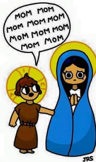
The First Rosary