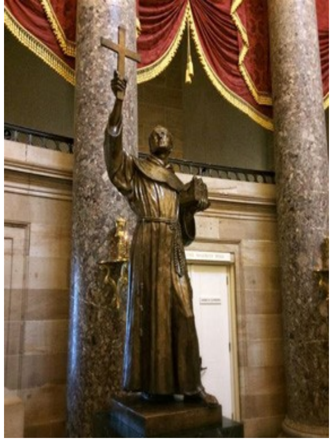
Fr. Junipero Serra