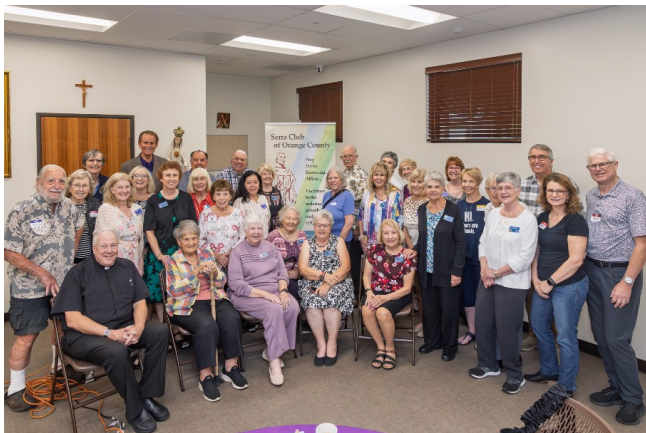
Serrans All – City & County Clubs Both

Do we just see the physical world or do also see the blessings, gifts and success of life along with the hardships, problems and injustices. To see these is to grow?