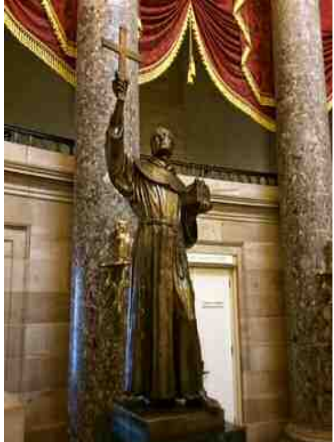
Fr. Junipero Serra