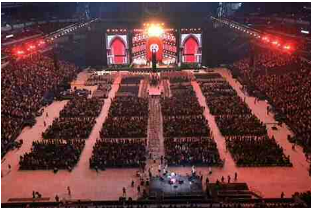
Eucharistic Congress in Lucas Oil Stadium, Indianapolis