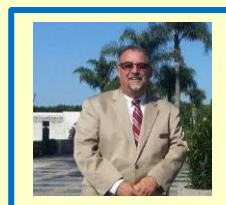
CATHEDRAL MEMORIAL GARDENS