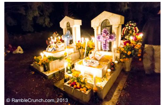
Altar decorated for "Day of the Dead".